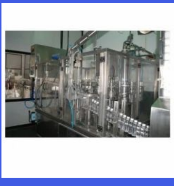
RCF Machine For Drinking Water