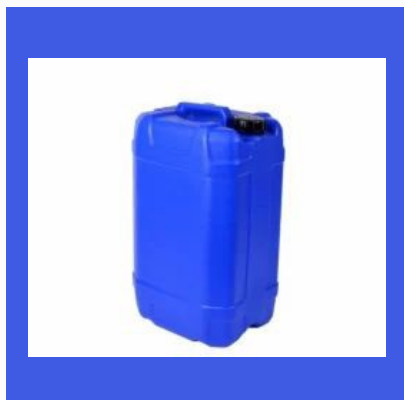
Boiler Antiscalant Chemical