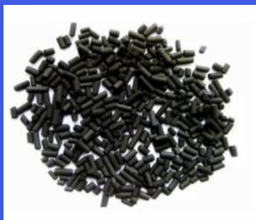
Norit Activated Carbon