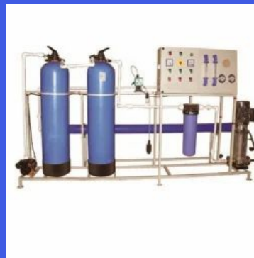
Industrial RO Plant