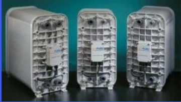
Electro Deionization System