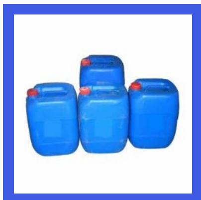
Membrane Cleaning Chemical