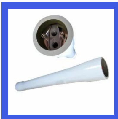
Membrane Housing 8040