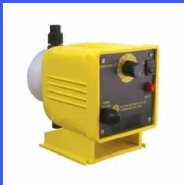
Milton Roy Dosing Pump