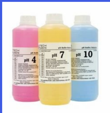
PH Buffer Solution