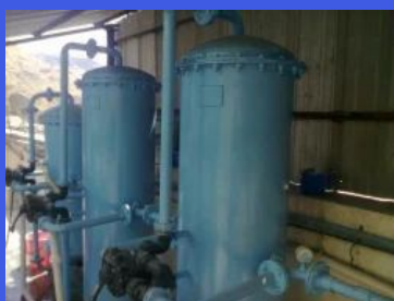
Water Softening Plant