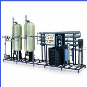
Reverse Osmosis Plant