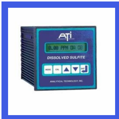
Online Conductivity Indicator