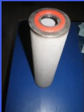
Sintered Filter Elements