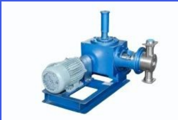
Chemical Dosing Pumps