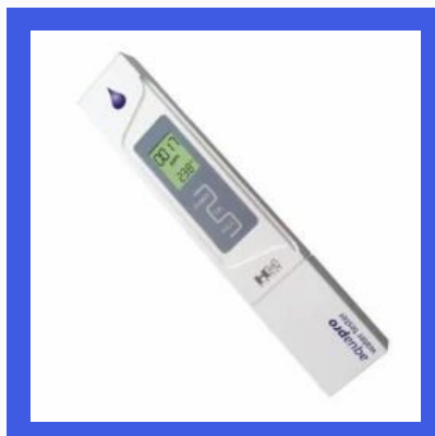
HM Digital TDS Meter