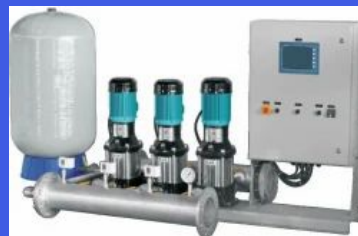
Pressure Booster System