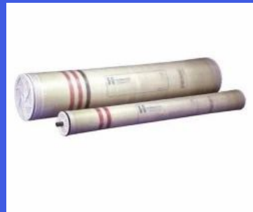
Hydranautics 8040 Membrane