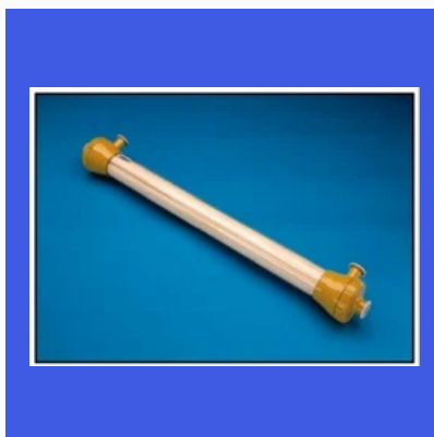
FS10-FS-FUS0353 Hollow Fiber UF Membrane