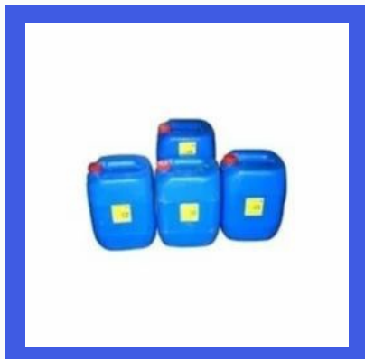
Cooling Tower Chemicals