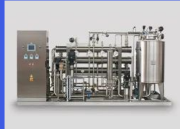
Pharmaceutical RO Plant