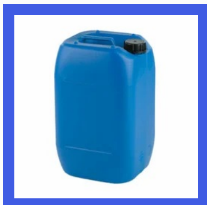
Industrial Aquastate Chemical