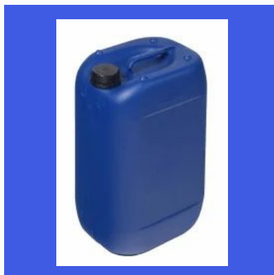
PH Booster Chemical