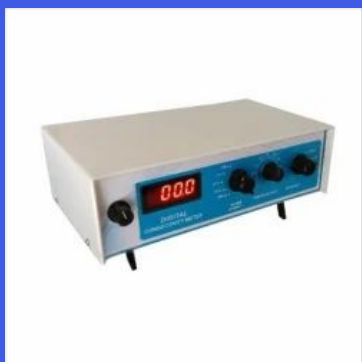
Digital Conductivity Meter