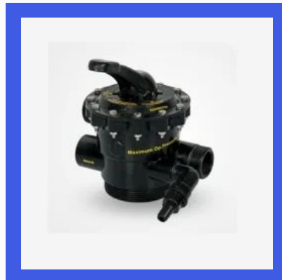
RO Multiport Valve