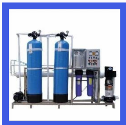
Commercial Reverse Osmosis System