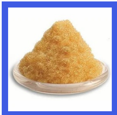
Ion Exchange Resin