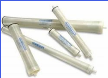
Filmtec 4040 Membrane