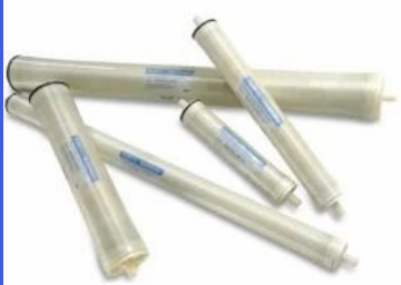
Dow Film Tech Membrane