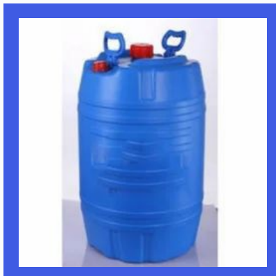
Boiler Antiscalant Chemicals