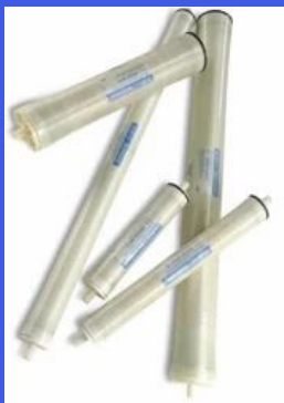
Dow Filmtec Membrane