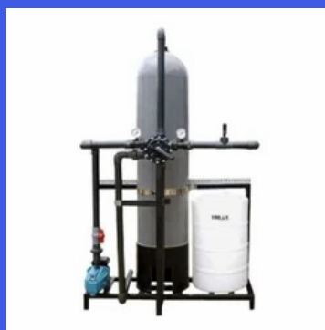
Industrial Water Softening Plant