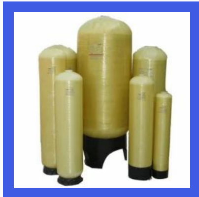
Star Lite Vessel