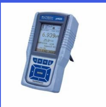
Handheld Digital Meter