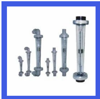
Aster Rota Meter