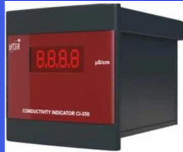
Aster Conductivity Meter