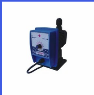
Liquid Dosing Pump