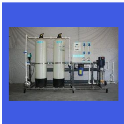
RO Water Plant