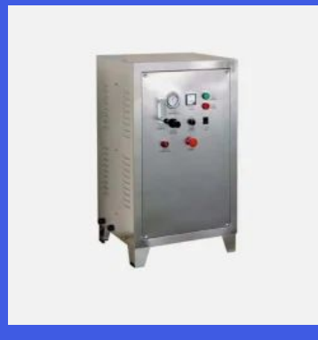
Portable Ozonator For Mineral Water