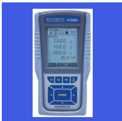
Digital pH Meter