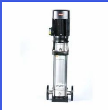
Industrial RO Pump