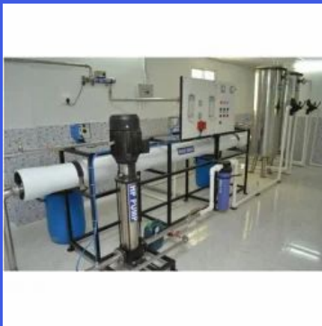
RO Mineral Water Plant