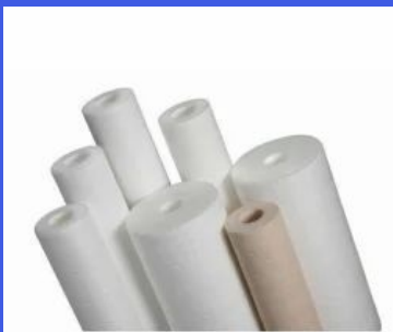
PP Spun Filter Cartridge