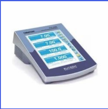
Multi Parameter Bench Top Meter