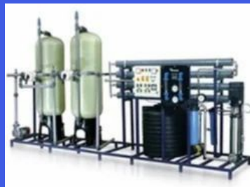
Purified water generation system