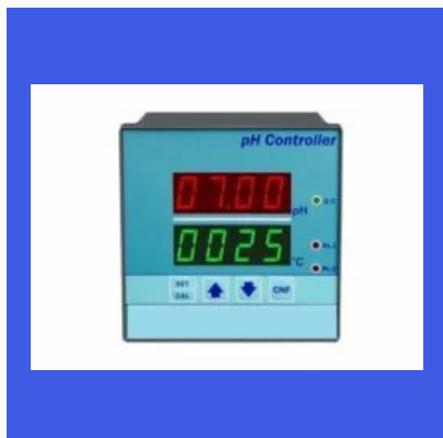
Online PH Indicator