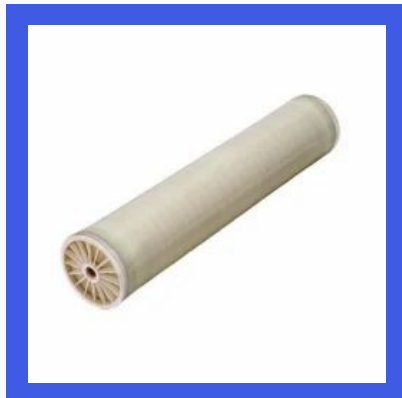
Dow Filmtec Membrane