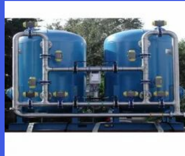
Filtration Systems For WTP