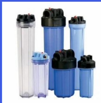
Water Filter Cartridges