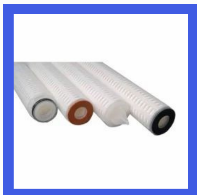
Water Pleated Cartridge