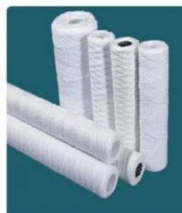
Wound Cartridge Filter