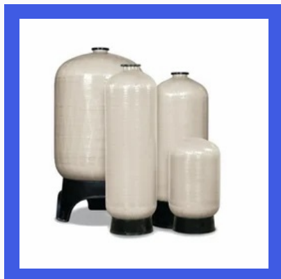
RO FRP Vessel