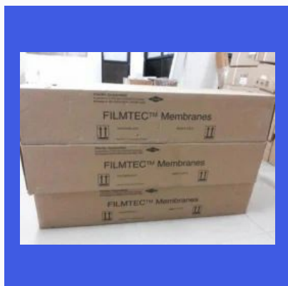
Industrial RO Membranes