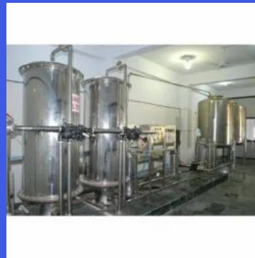
Industrial Water Plant