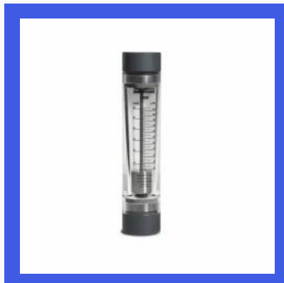
Magnetic Flow Rotameter