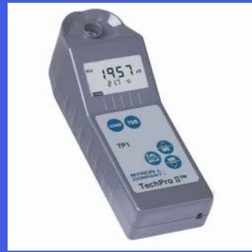
Handy TDS Meter