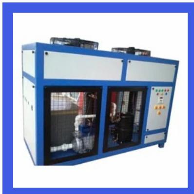
Drinking Water Chiller