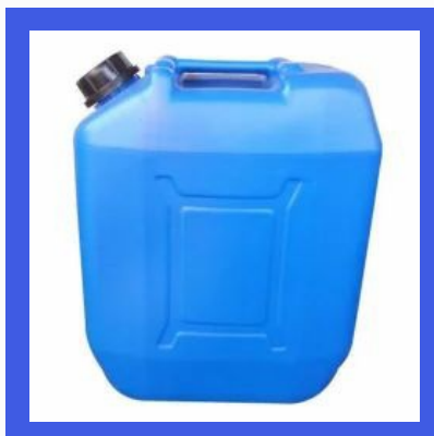
Antiscalant Dosing Chemical