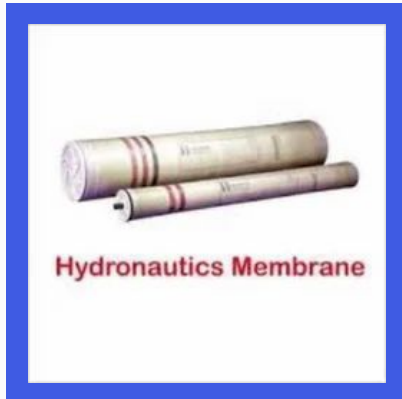
Nitto Hydranautics Membrane