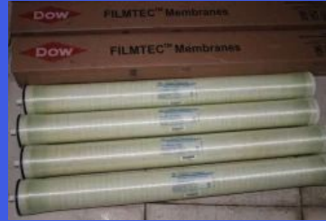
Dow Filmtec Membrane