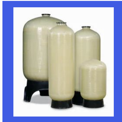
RO FRP Vessels