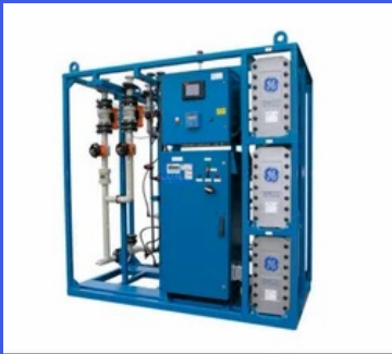
Electro Deionizer Unit