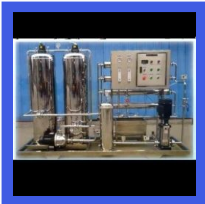
Mineral Water Plant