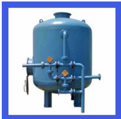
Water Filtration Plant