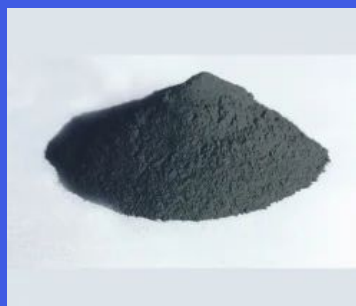
Norit Activated Carbon