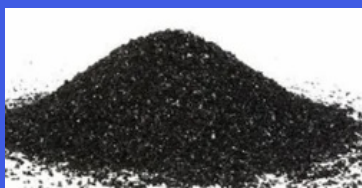
Activated Carbon For Water Purification