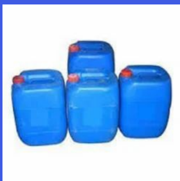
Cooling Tower Antiscalant Chemical