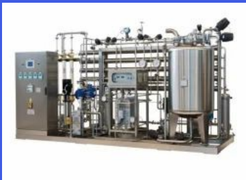
Pharmaceutical Reverse Osmosis Plant