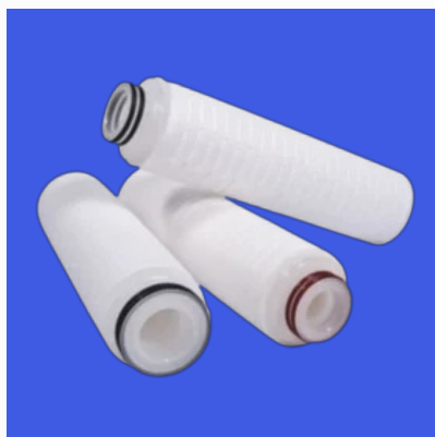
PP Pleated Cartridge Filter