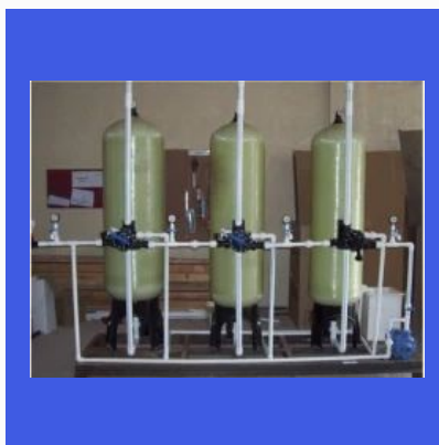
Demineralization Plant System