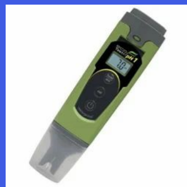
Pocket Tester Meter