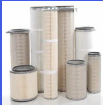
Dust Collection Filter