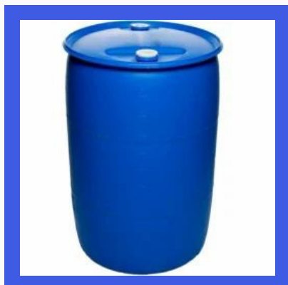
RO Antiscalant Chemical